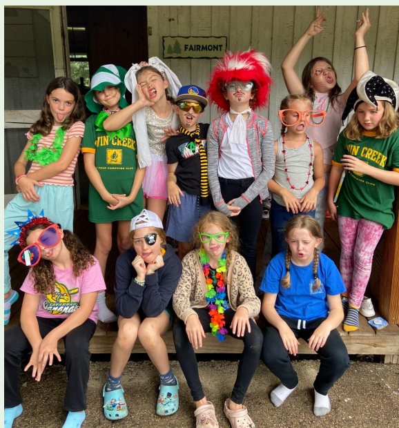
Soft skills are the most important skills! Fairmont demonstrating creativity and teamwork before their Putting on the Hits performance.

Welcome to the Littles Letter! We have been having a blast here at camp – taking advantage of the nature around us, practicing teamwork in activities, and exploring our creative side – all while making friends and singing songs whenever we get the chance. Stay tuned for updates, announcements, and pictures!