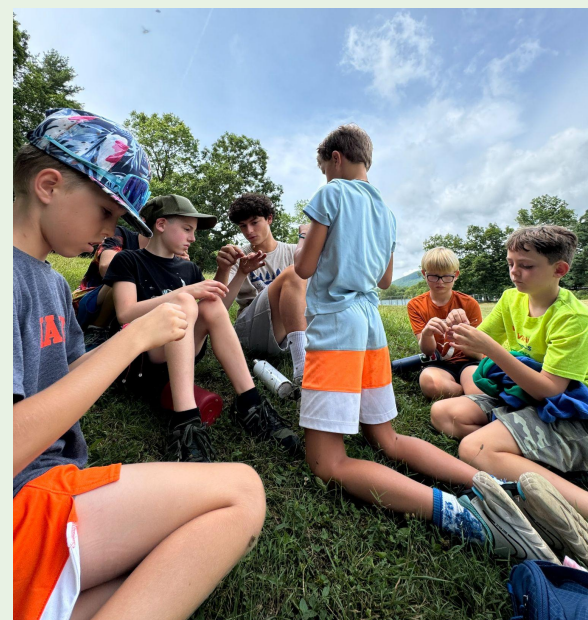
Our environment is our best educator! Elkins campers making bracelets out of flowers.

On Monday evening, we had Main Village Shark Tank! Campers were tasked with creating a prototype of an invention to benefit camp. Using soft skills of imagination, problem-solving, and public speaking, they presented their ideas to the “sharks,” thinking on their feet to answer audience questions. Dawson and Davis had a creek walk on Tuesday! They learned about the history of camp, made rock paint, and spotted crayfish! Tonight, Fairmont will enjoy their EBTO (everything but the overnight).