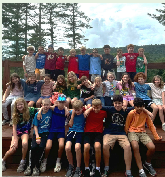
Community is the antidote to loneliness! Fairmont, Elkins, and Grafton after a fun afternoon of scavenger hunts and gaga!